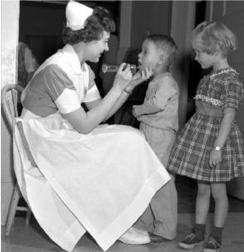
State had a nursery school and the college provided various clinical activities.