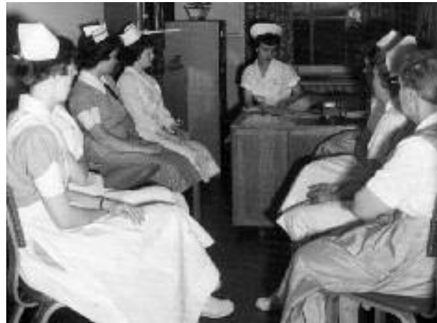
Nursing care planning conference.

Courses in arts and science were initiated for the completion of a baccalaureate degree in nursing for those who were RNs from diploma programs.