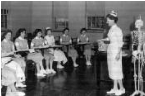
An early nursing class.