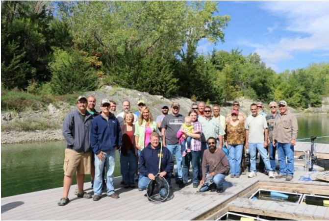
Pond Boss regional gathering in September 2013 just south of Lincoln, NE; this is a wonderful group of friends.

These meetings always involve a wide range of people, from private pondowners to private sector fisheries biologists, and the information exchange DOES flow. The knowledge base of both of those groups is impressive. See the picture below for the floating dock/net pen arrangement at the private pond at the house where we met. Fish cage culture and sport fish attractor, all in one! The Pond Boss family is one of our primary donors for the Jesse W. West Fisheries Research Endowment .