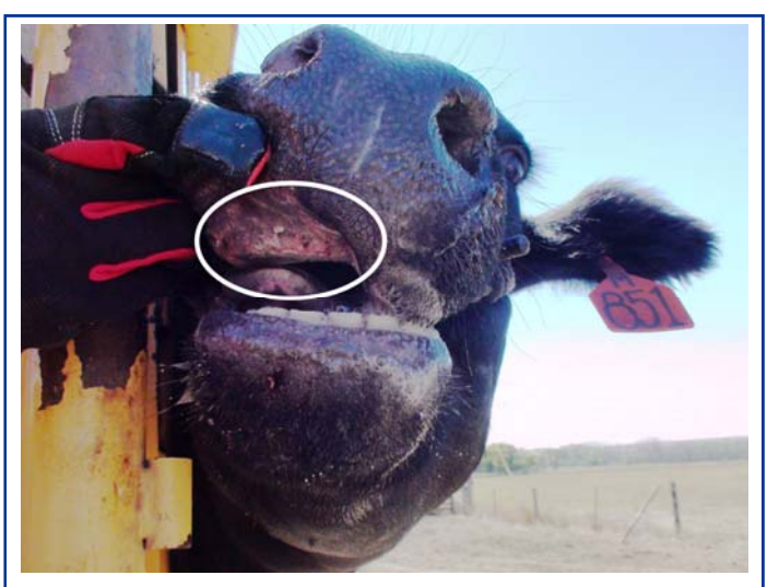
Representative oral lesion from a beef cow affected with EHD: erosion of the mucosal surface of the rostral dental pad (circle).

ested in EHD. The nature of the oral lesions in these animals makes it essential to rule out serious foreign animal diseases such as foot and mouth disease and other vesicular diseases. Cattle producers and veterinarians should not become