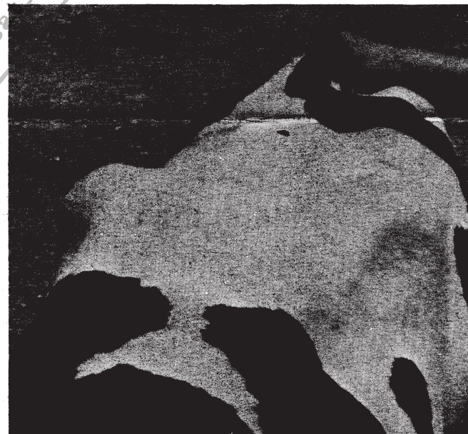
Fig 6. A blurred crayon mark on the tail head means the cow has been mounted. This method requires a livestock marking crayon and the same careful checking you'd do with any other method.