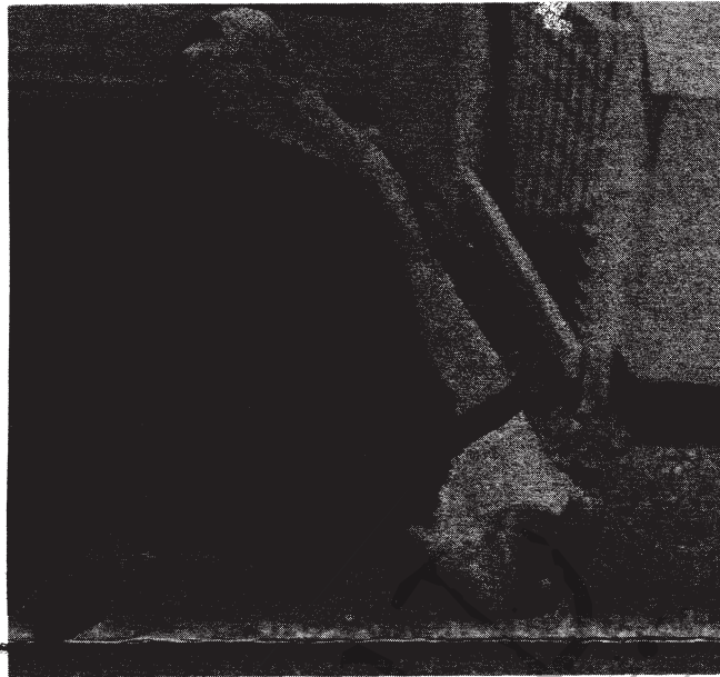
Fig. 7. The chin ball marking device transfers the burden of proof to the gomerized or otherwise specially prepared animal doing the mounting. Ink is rubbed on the cow in heat, but the catchy part comes in determining whether the mark is old or new, and whether or not it is accidental.

synchronized cows can be bred at a pre-determined time without observation for heat. New and effective synchronization products should be on the market in 1979.