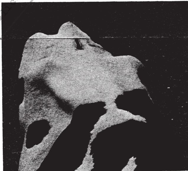
Fig. 3. An activated KaMaR heat mount detector is red. She has been mounted. This detector is especially good for cows whose heat periods are difficult to catch. Keep close observation.