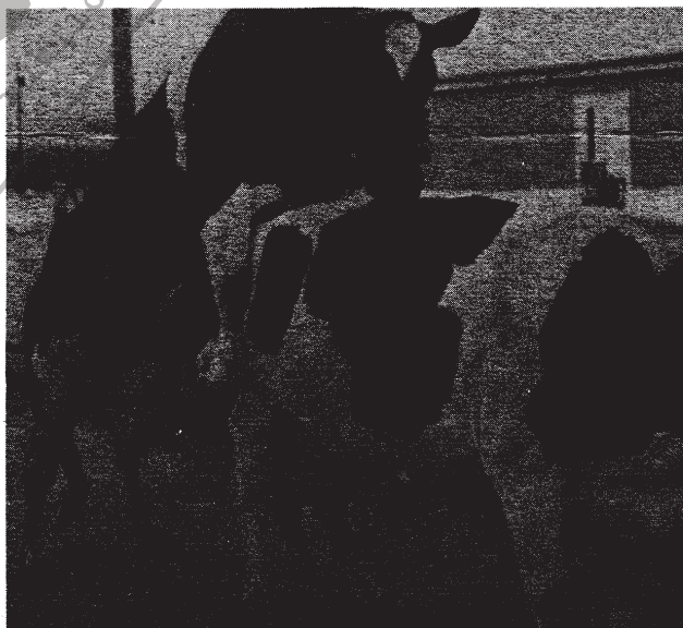
Fig. 1. Your goal is to see the actual mounting. Remember that if she stands while crowded by other cows she may not be in heat. It's a much better sign if she stands when she could move away.

The following information on external signs, records, and heat detection aids will help you catch cows in standing heat and identify and catch some "problem" cows.