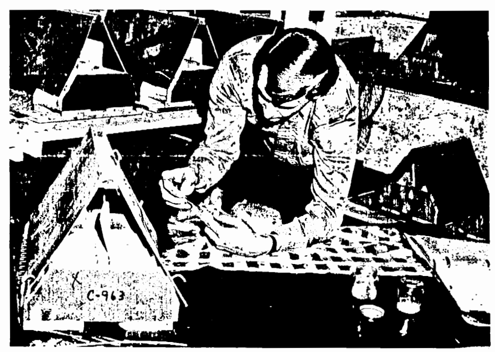
Fig. 1. Individual hen cages and method of administering capsules.