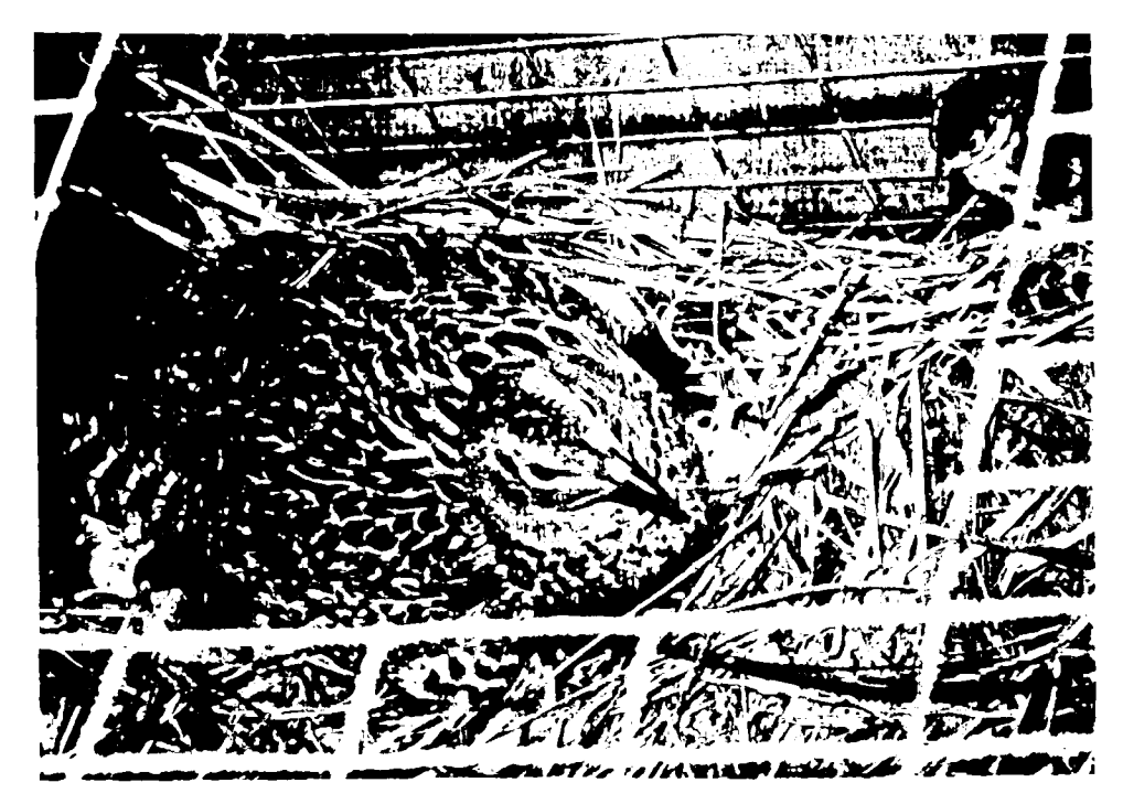
Fig. 4. Many hens accepted and brooded introduced chicks.