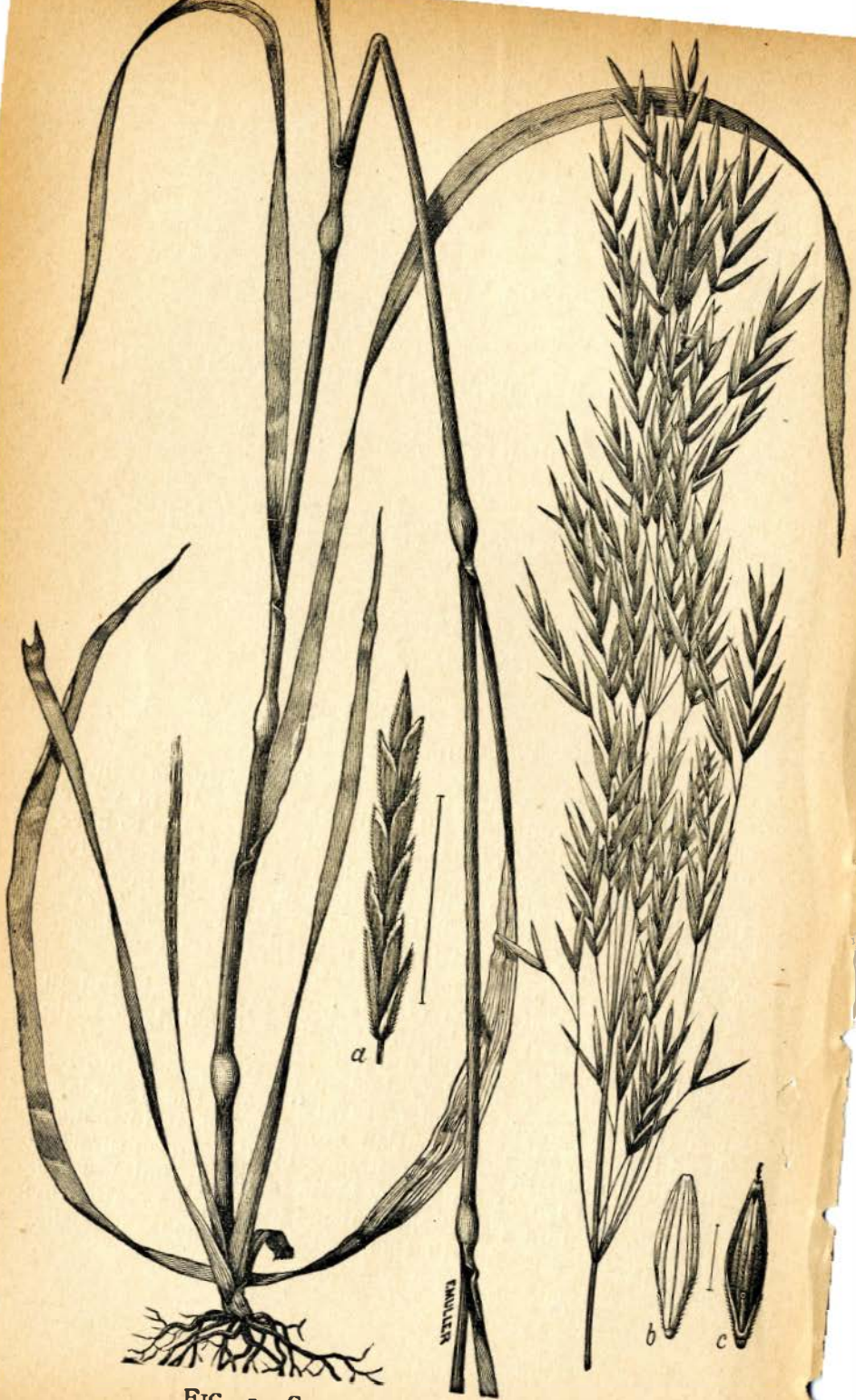
FIG. 1—Smooth Brome Grass.