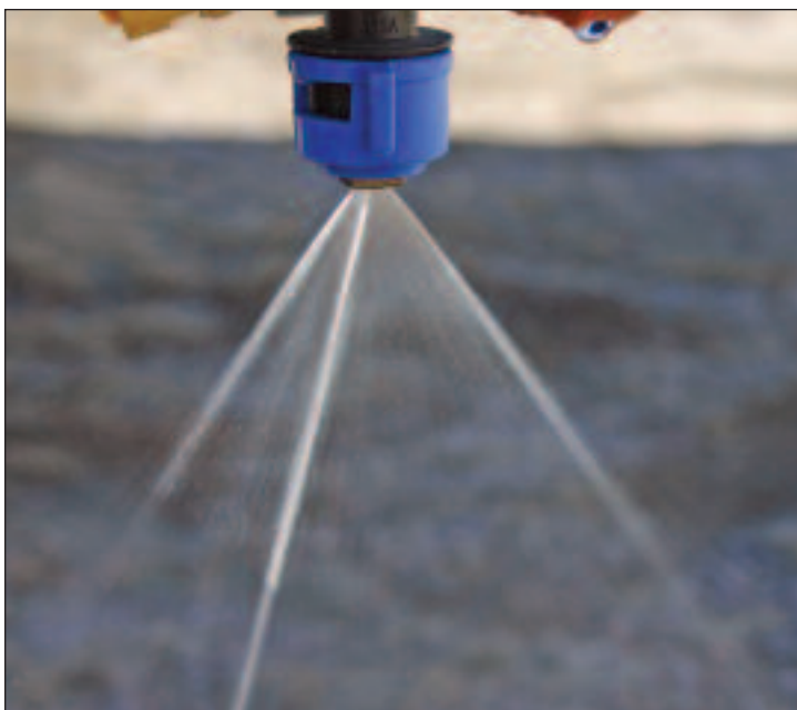
Check nozzles for uniform pattern. This nozzle was damaged while cleaning.

Now fill the sprayer with clean water and park it at the end of a field. Start the sprayer and adjust the pressure to an approximate pressure that you intend to use. Catch the output from each nozzle for an equal amount of time, using a measuring cup marked in ounces.