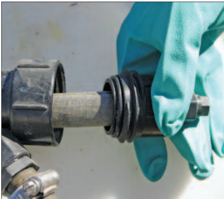
Clean all strainers and nozzle screens before calibrating.