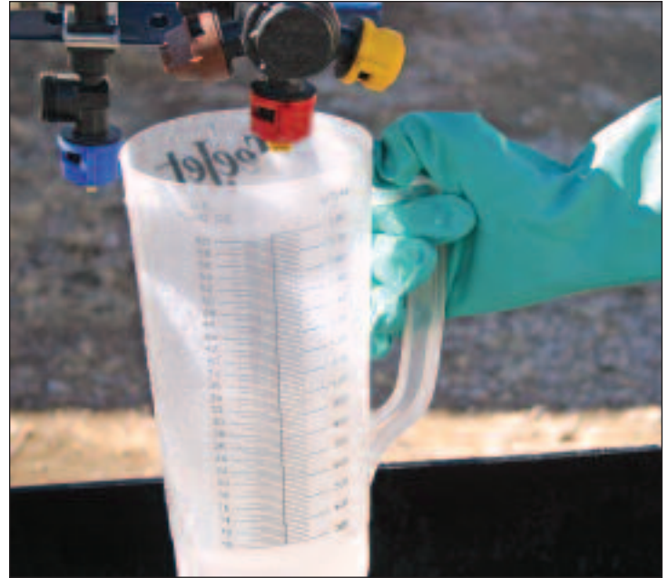
Check all nozzles for uniform output.

Let’s assume that the time to cover 204 feet is 28 seconds. Park your sprayer, filled with clean water, at the end of the field, set to the pressure you plan to use, and measure how much water you collect during 28 seconds from one nozzle. If you collect 11 ounces, your application rate would be 11 gallons per acre (gpa). If you really wanted 10 gpa you may be able to slightly decrease your pressure and collect from a nozzle again.