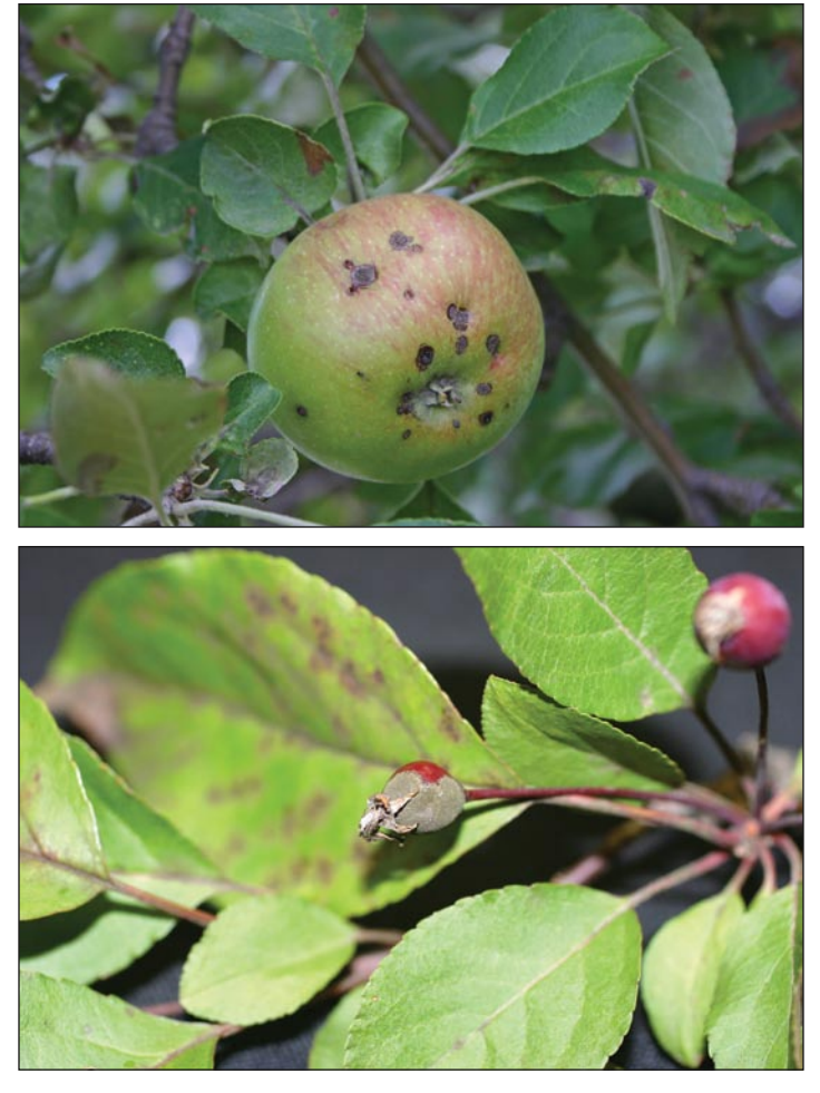
Fig 4. Lesions of apple scab on apple fruit. A. Lesions on edible apple fruit. B. Lesions on Red Splendor crabapple fruit.

Because a film of water on leaves and fruit is required for infection to occur, apple scab is most severe during years with frequent spring rains.