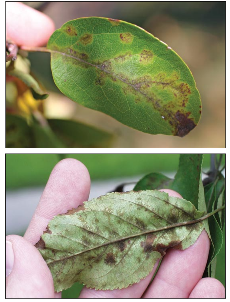
Fig 2. Lesions closely associated with leaf veins. A. Upper leaf surface. B. Lower leaf surface.