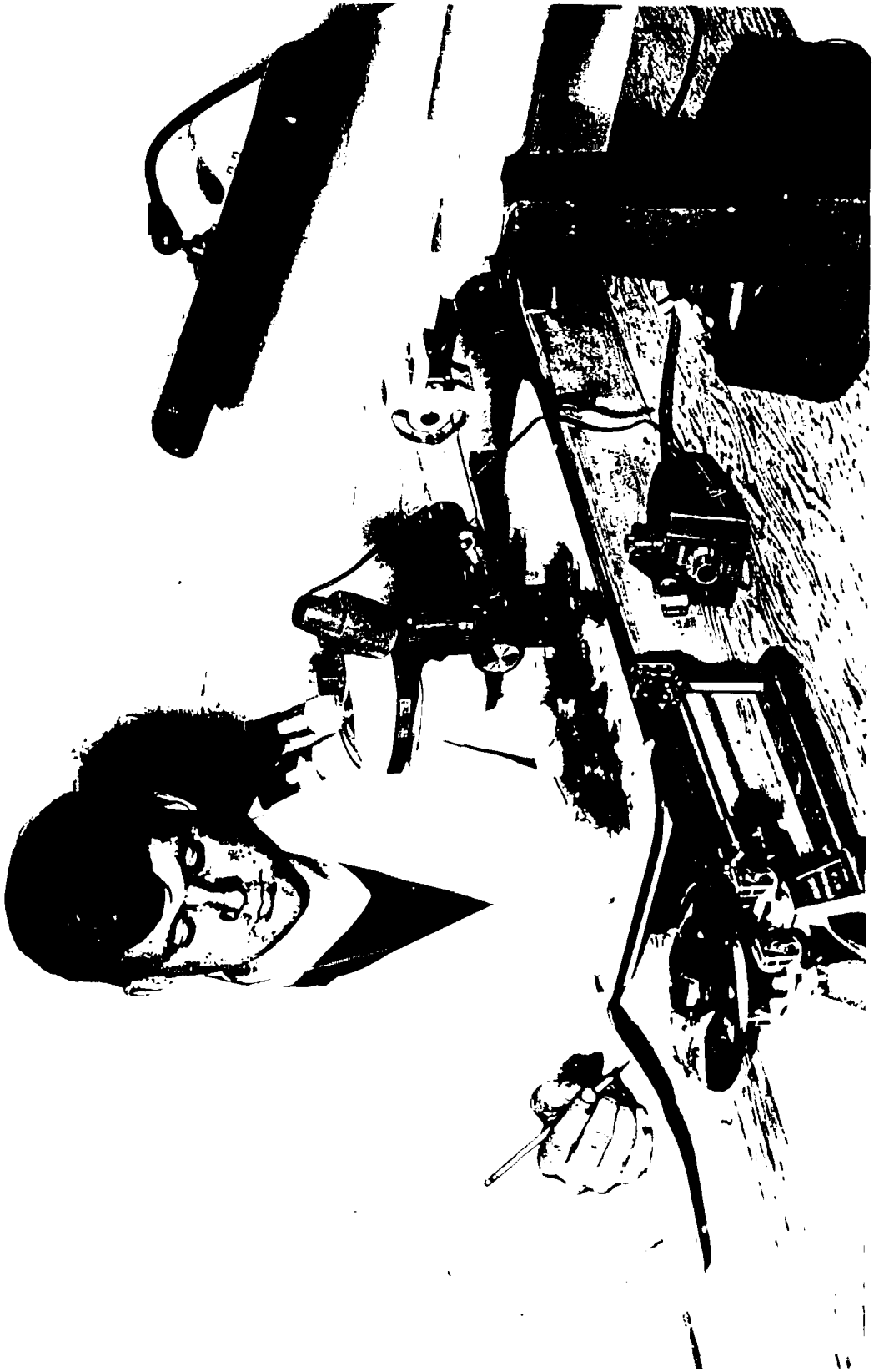
Fig. 1. Rumen samples were placed on a tray and analyzed using the point technique.