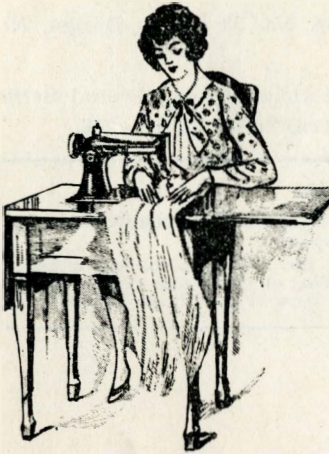
Fig 3.—A means of extending the home funds.

Factory garments are seldom ready to wear without slight changes or reinforcement of the construction. A few hand stitches or slight changes in seams prolongs the time of wear and saves mending. Undergarments not purchased in sanitary packages should be laundered before wearing. Aside from the hygienic advantages of washing, these garments mold to the body with a more even stretch, and give the fit and comfort necessary.