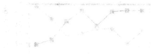
Fig. 1. A diagram showing a series of points connected by lines, forming a zigzag pattern.

The eighth part is devoted to the case of a system of particles in a magnetic field.