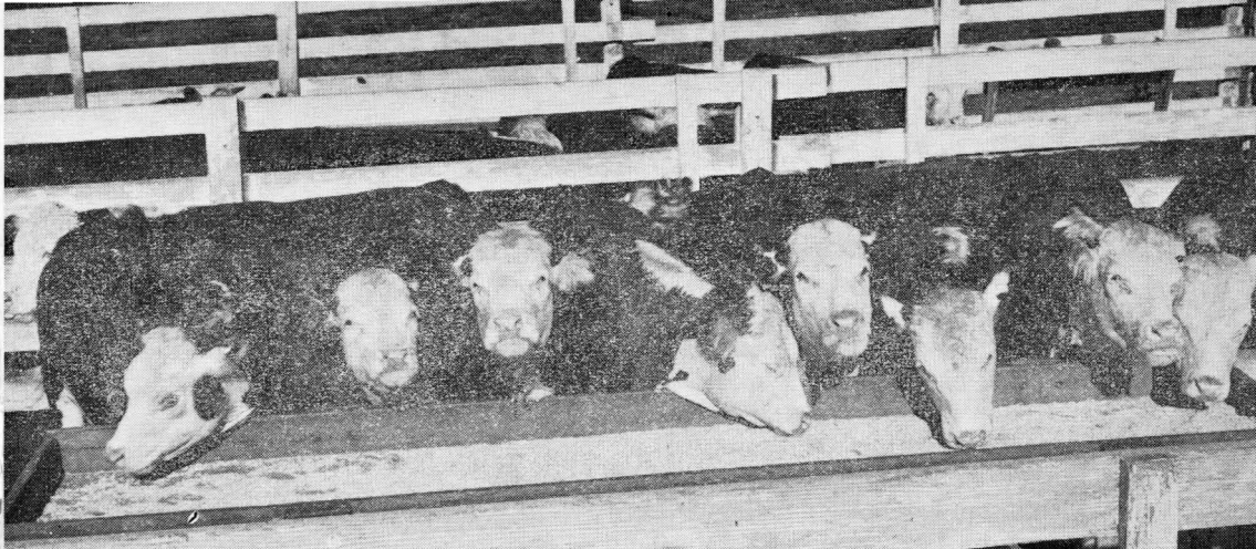
Dehorned Cattle at Feed Bunk.

and 2 while the heifers were allotted to Lots 3 and 4.