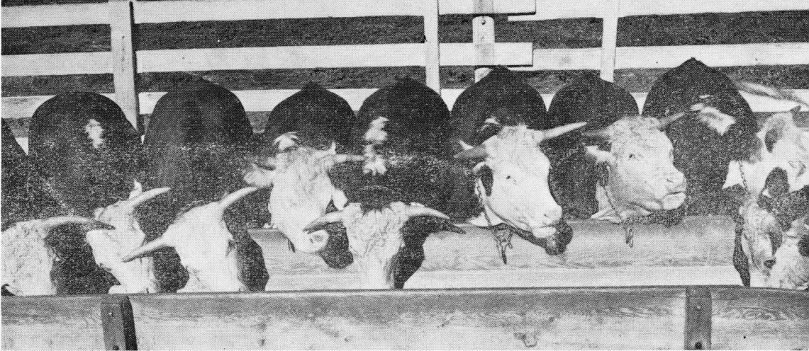
Horned Cattle at Feed Bunk.