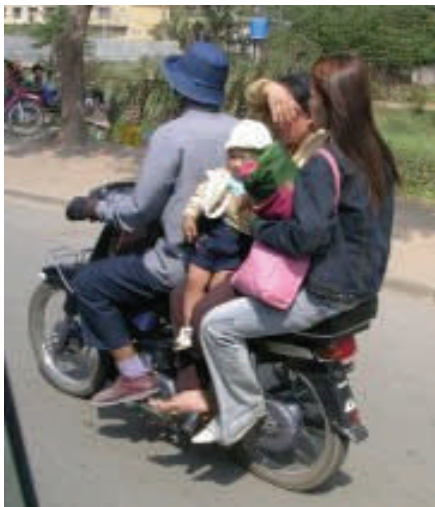
Is there a limit to the number of people who can ride on a 100 cc motorcycle?

zation, I had the opportunity to visit Cambodia in February 2005. Cambodia is a third world country where many people only earn one dollar per day and was a victim of a rogue Pol Pot regime where most of its educated citizens were tortured and/or killed about 30 years ago. Our team of six accepted the responsibility of assessing the possi-