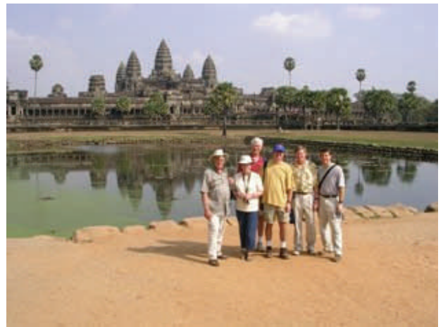
Angkor Wat is one of the "Seven Wonders of the World." The visit was very interesting.

In addition, we reviewed water supply options including polluted ground water being used by those in adjoining