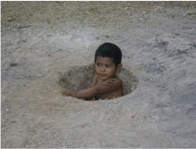
How does a child using a percolation test hole for play affect test results (such information is not found in text books)!

As a member of an Engineering Ministries International team, an engineering and architectural volunteer organi-