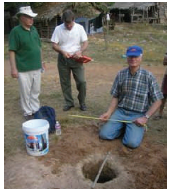
Measuring water level changes during a percolation test.

century Angkor Wat temple ruins. The temples were originally constructed by Hindu believers from India but today are the domain of Buddhist faithful.