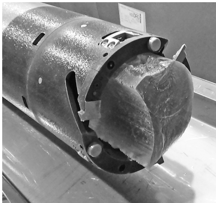
This chunk of ice has made history. A National Science Foundation-funded replicate core drilling team was able to retrieve cylinders of ice from the original ice core hole while leaving the borehole intact.