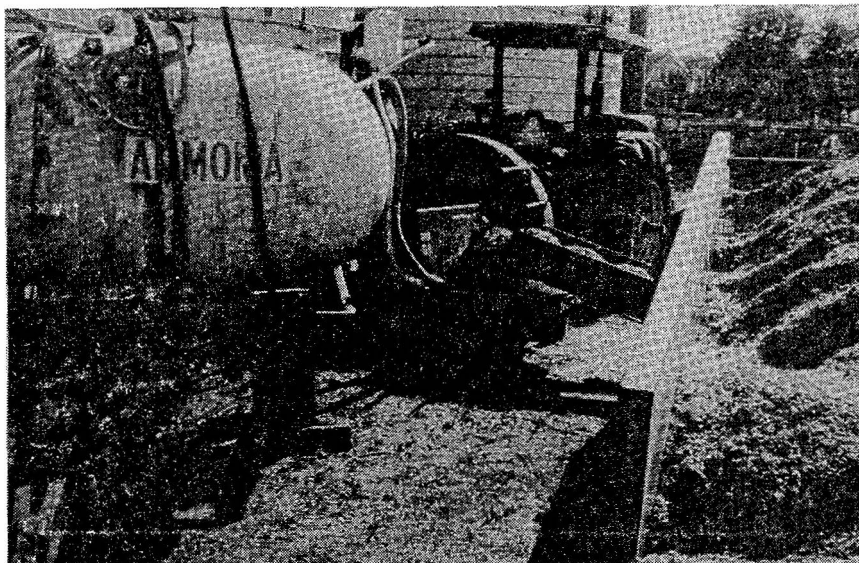
Anhydrous ammonia was applied to chopped forage sorghum using the Cold-Flo system.

The results of this experiment indicate that Cold-Flo anhydrous ammonia is efficiently utilized as a nonprotein nitrogen source with forage sorghum silage. Further research is necessary with other low energy silages to confirm this original finding and expand the beneficial uses of this inexpensive silage additive for producers.