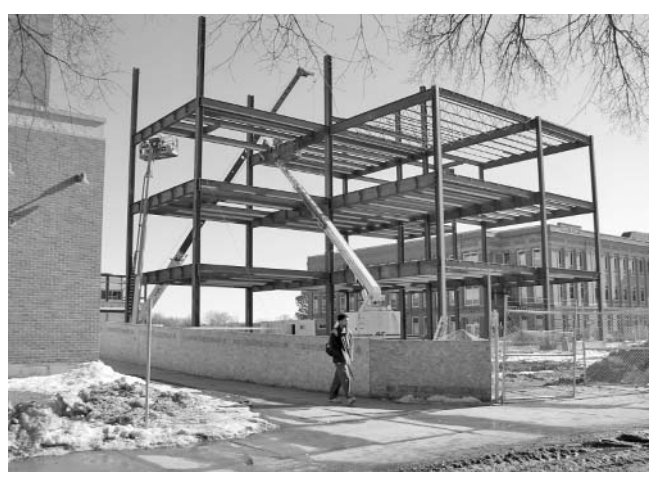
In February lots of steel beams could be seen above the foundation.