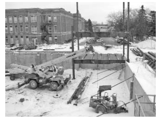
After much underground preparation and pouring of concrete for the foundation, January saw work begin above ground.