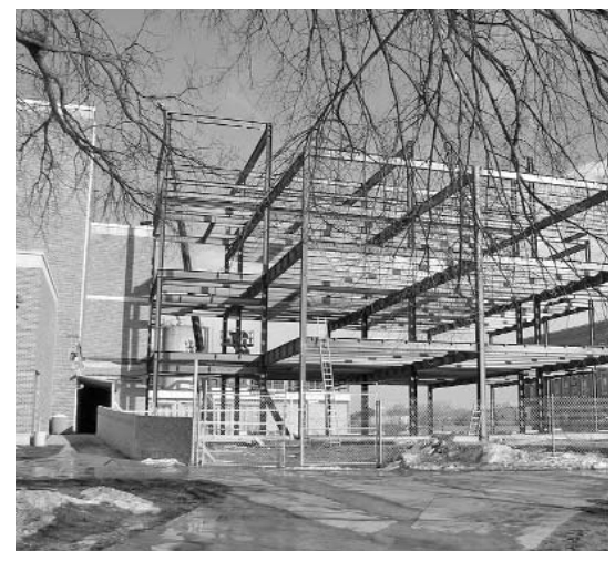
In March the steel skeleton suggested just how large the building is going to be.

By April the floors were in place and the exterior walls were starting to be erected.