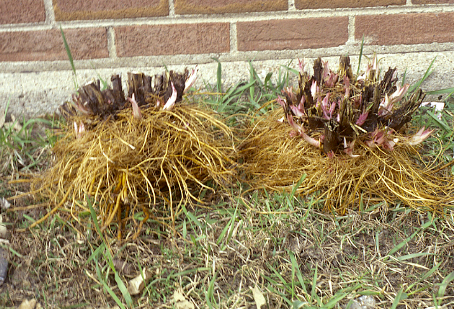
Figure 5. Silphium perfoliatum crowns showing rhizomes and adventitious roots; crowns ca. 50-60 cm across.