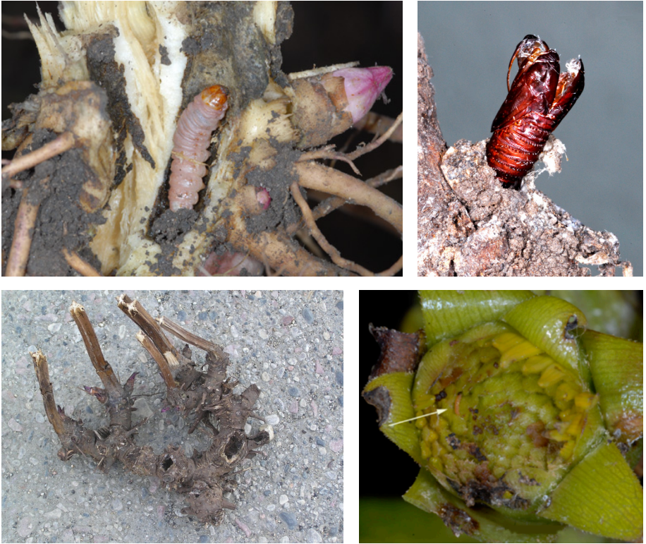
Figures 7-10. Eucosma giganteana and Silphium perfoliatum , clockwise from upper left. Figure 7, S. perfoliatum rhizome beneath proxis with E. giganteana larva in situ. Figure 8, Pupal exuvium partially exerted from emergence hole in crown as shown in Fig. 6. Figure 9, Partial rhizome complex showing horizontal and bifurcating growth. Figure 10, Floral bud with first instar larva on disc.