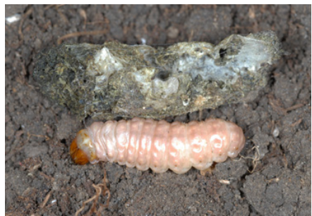
Figures 1-4. Eucosma giganteana , clockwise from upper left. Figure 1, Adult, ca. 32 mm long. Figure 2, Egg mass with five eggs, each egg 1.9 mm long. Figure 3, Third instar larva removed from infested bud, ca. 11.0 mm long. Figure 4, Cocoon, ca. 32 mm long, and prepupal larva, ca. 23 mm long.