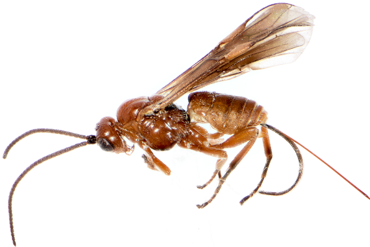
Figure 13, Bracon cf. mellitor , body length ca. 5.0 mm, collected while ovipositing into S. perfoliatum buds infested with E. giganteana larvae.