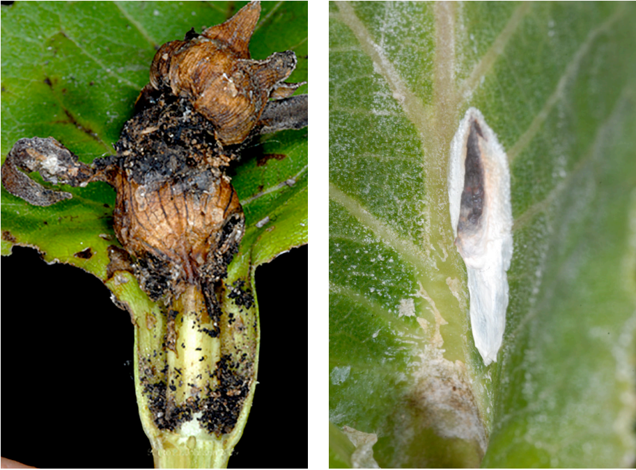
Figures 11-12. Figure 11 (left) Silphium perfoliatum shoot apex with dead and decayed floral meristem resulting from E. giganteana larval feeding. Figure 12 (right) Common example of bird dropping on leaf midrib of S. perfoliatum , compare with Figure 1.