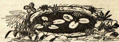
Ground Level Pool

We first with a hoe pulled out enough earth from the center to around the edges to form a rough outline of the proposed pool, this depression made the form for the base or bottom, which was filled with concrete to some six inches in depth, first filling in about three inches then laying the reinforcing, which may be old wire, chicken netting, etc. In this case it was an old woven wire bed spring cut down to shape.