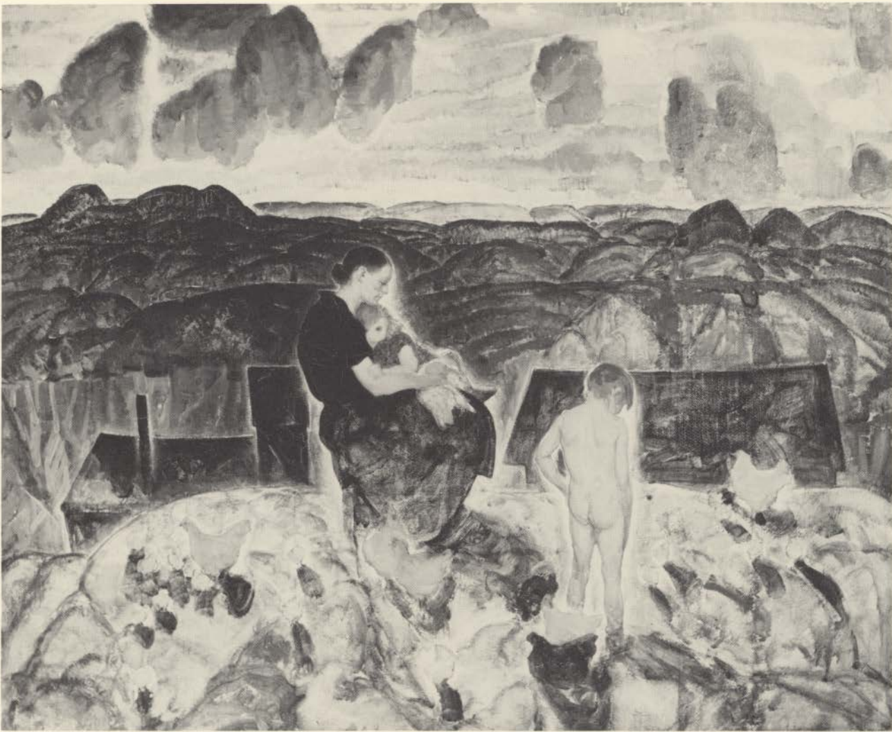
Jes Schlaikjer's "The Homestead"