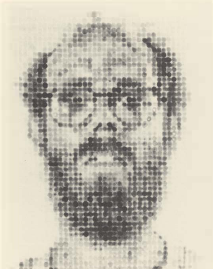
Chuck Close's "Self Portrait"