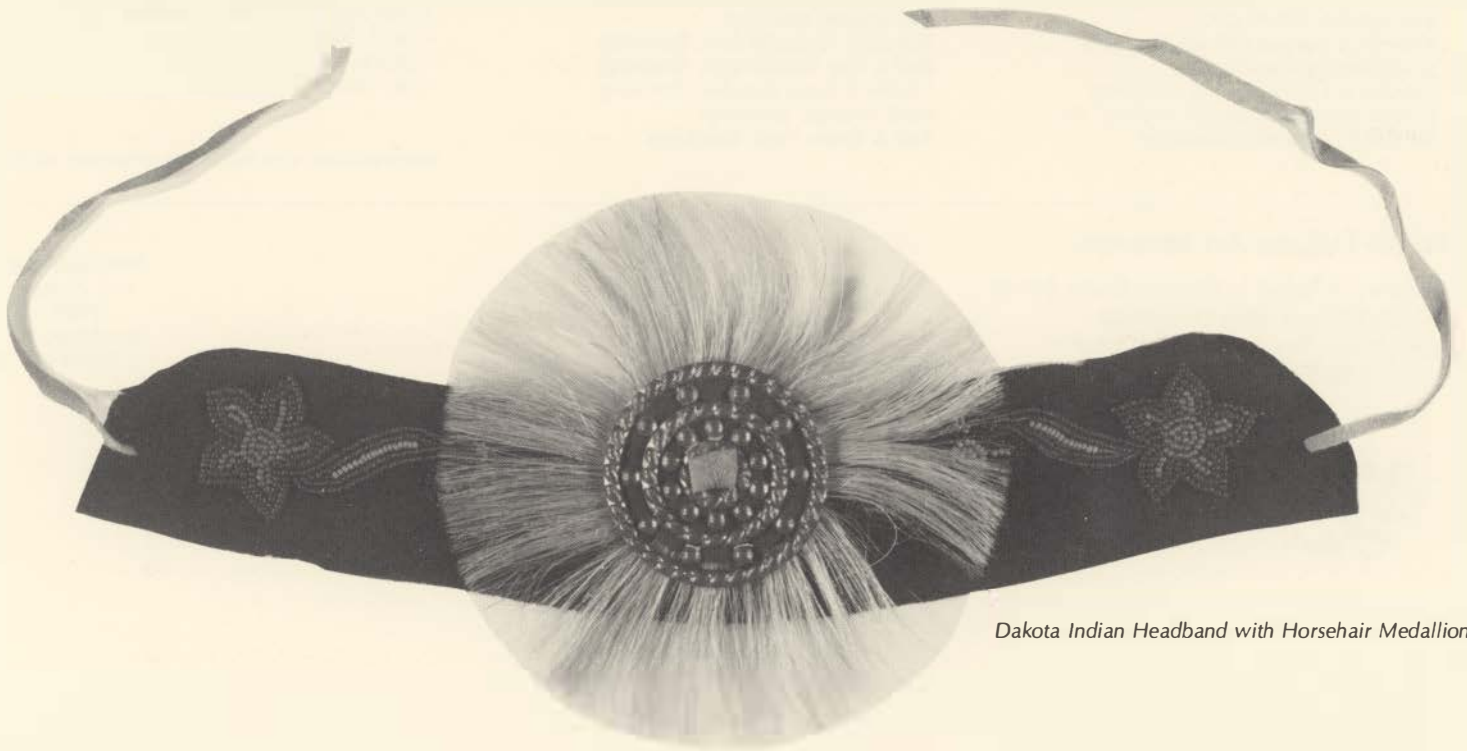
Dakota Indian Headband with Horsehair Medallion