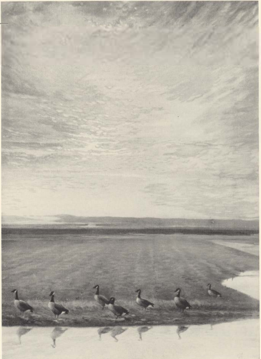
Charles Greener's "Honkers at Sunrise"

A 16-painting selection from the Greener Collection, including "Honkers at Sunrise," is available for tour around the state. The modest fee for a 21-day showing includes transportation, insurance, installation assistance, labels, introductory text, and press kit. For non-traditional but secure spaces like banks and libraries, free-standing partitions are available at no extra cost. For further information on this touring exhibition, contact Francine Marcel at the Museum.