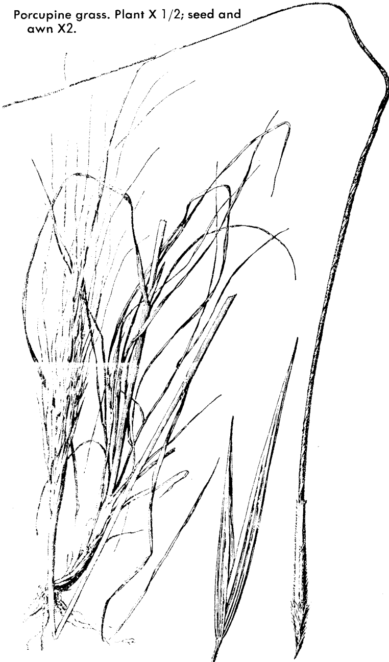
Porcupine grass. Plant X 1/2; seed and awn X2.

Green stipagrass is a variety of green needlegrass selected in North Dakota and released in 1946. It produced 4- or 5-year average yields of about 1.4 tons per acre at Eureka and Cottonwood. Lodorm is the variety of