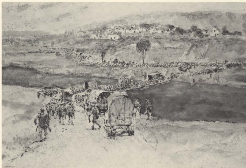
Harvey Dunn's "Crossing a Pontoon Bridge"