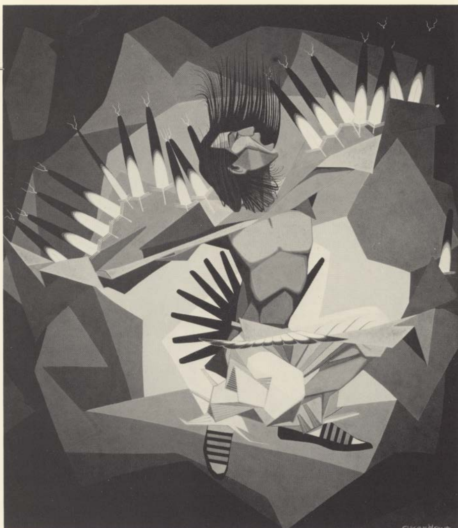
Oscar Howe's "Eagle Dancer"