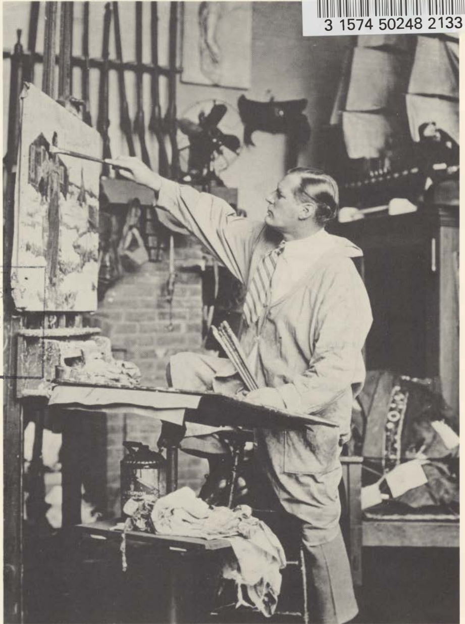
Harvey Dunn in his Tenafly, New Jersey, studio, about 1940