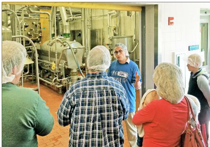
A Davis Dairy Plant tour.

Throughout the year, the plant hosted numerous processing companies for research projects. In 2018, the department once again extended invitations to all our Jackrabbit Dairy Council members and donors for the dairy plant