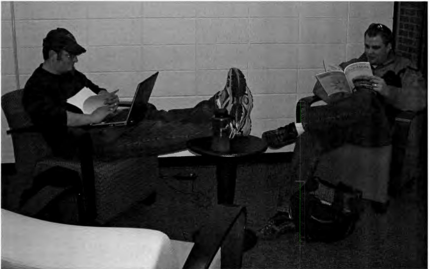
Students catch up in between classes at the School of Mines and Technology's Devereaux Library

Like all forward-looking projects, however, development of the strategic plan will require hard work and dedication by the staff and members alike. The Strategic Planning process began with an environmental scan and the use of Delphi Technique to determine the most critical strengths, weaknesses, opportunities and threats facing the network. The SDLN Executive Committee is leading the planning process and seeking input from across the network's stakeholder audience. The timeline anticipates that the final draft of the plan will be delivered to the SDLN Advisory Council for ratification and adoption at its Spring 2008 meeting.