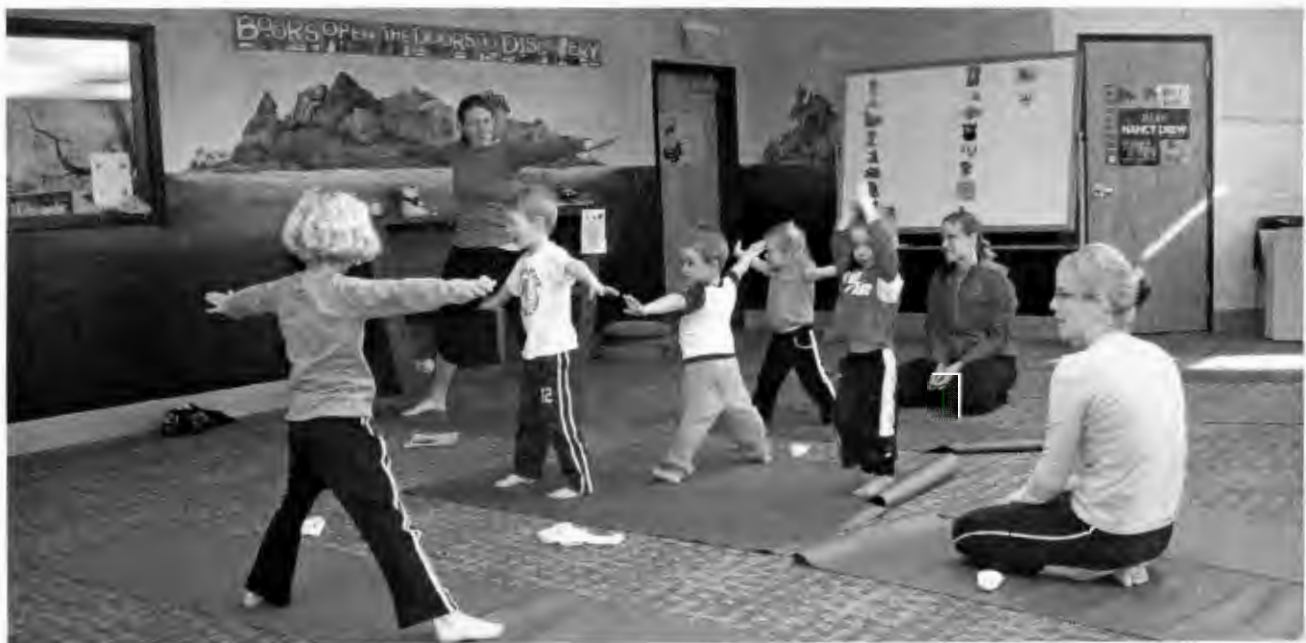
Kids Practice Yoga at Sturgis Public Library