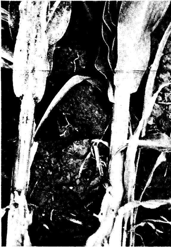
These two sorghum plants illustrate the advantages of using proper control methods against greenbugs. Discolored leaves and a heavy infestation of greenbugs can be noted on the plant at left which was not treated.

Economic thresholds depend on plant size and growing conditions. Suggested guidelines before control measures should be applied are shown in Table 1.