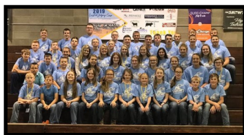
Livestock Judging Camp 1

The SDSU Youth Livestock Judging Camp held two sessions in the Animal Science Arena. Session 1 was held June 10-12 with Session 2 on June 13-15. The sessions were available to students age 8-18 years. Instruction at the camps covered live evaluation of the primary livestock species (cattle, sheep/goats and swine), as well as preparation and critique of oral