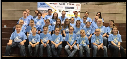
Livestock Judging Camp 2

reasons. Eighty campers from South Dakota, Minnesota, Wisconsin, Nebraska, Iowa and North Dakota attended the camp.