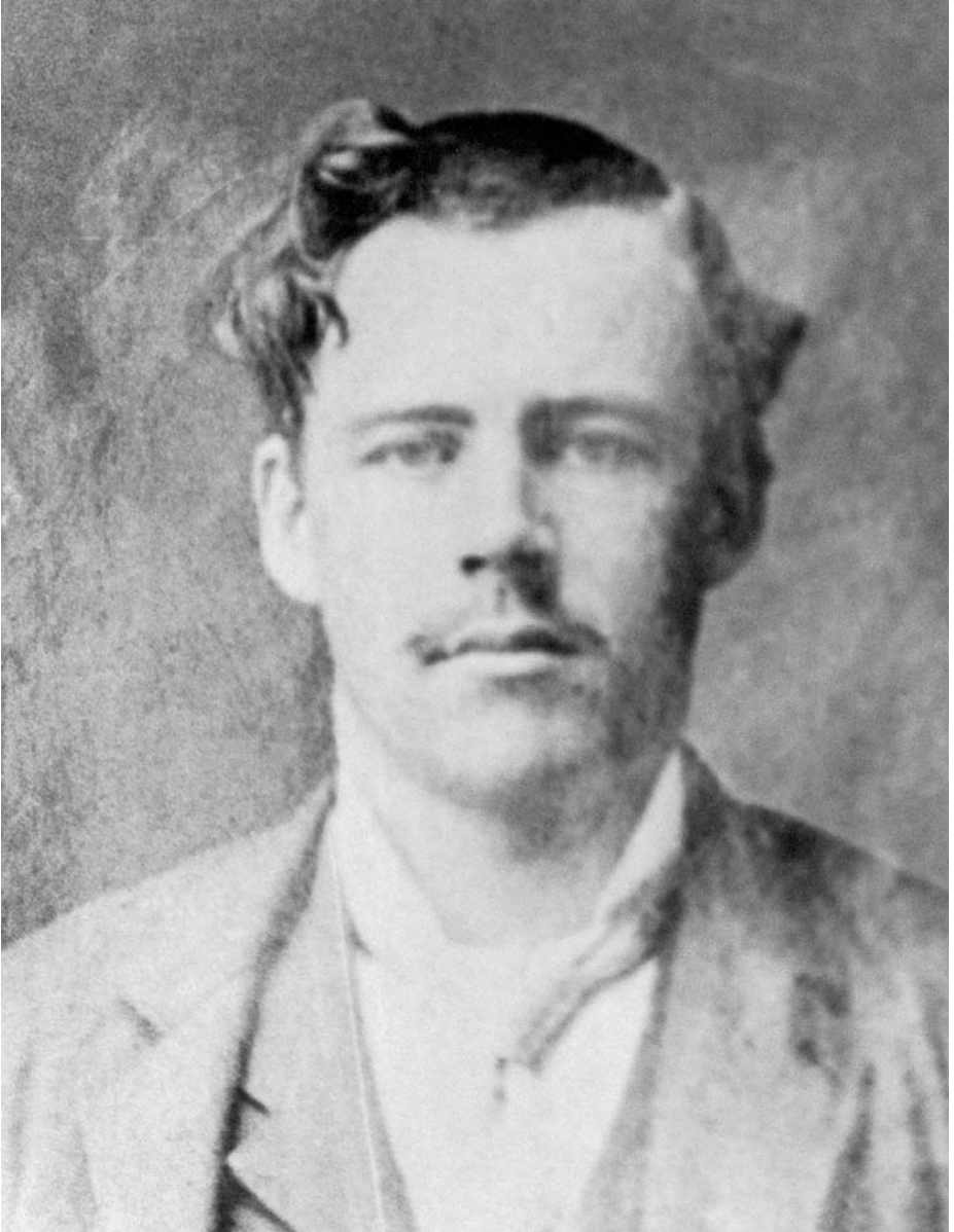
Figure 2. Norwegian immigrant Ole Edvart Rølvaag spent the summers of 1899 and 1900 selling books while attending Augustana Academy in Canton, South Dakota.