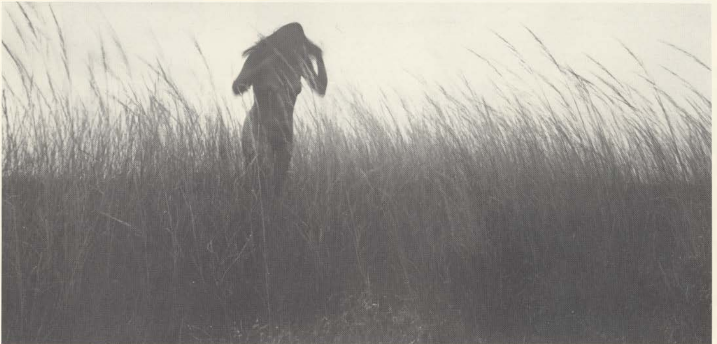
Judy Dater's "Self Portrait," 1981, from Reclaiming Paradise