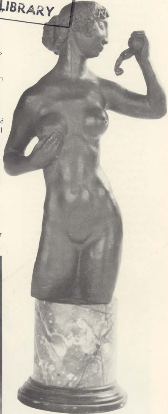
Carl Milles' "Girl with Apple," 1913

SOUTH DAKOTA STATE UNIVERSITY SEP 2 1988 LIBRARY