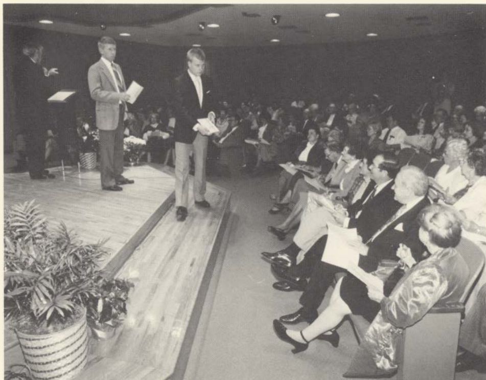
Marghab Linen Auction, Museum auditorium