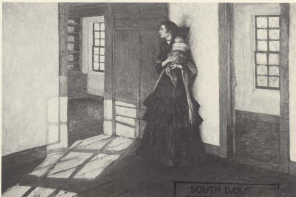
Harvey Dunn's "Empty Rooms"