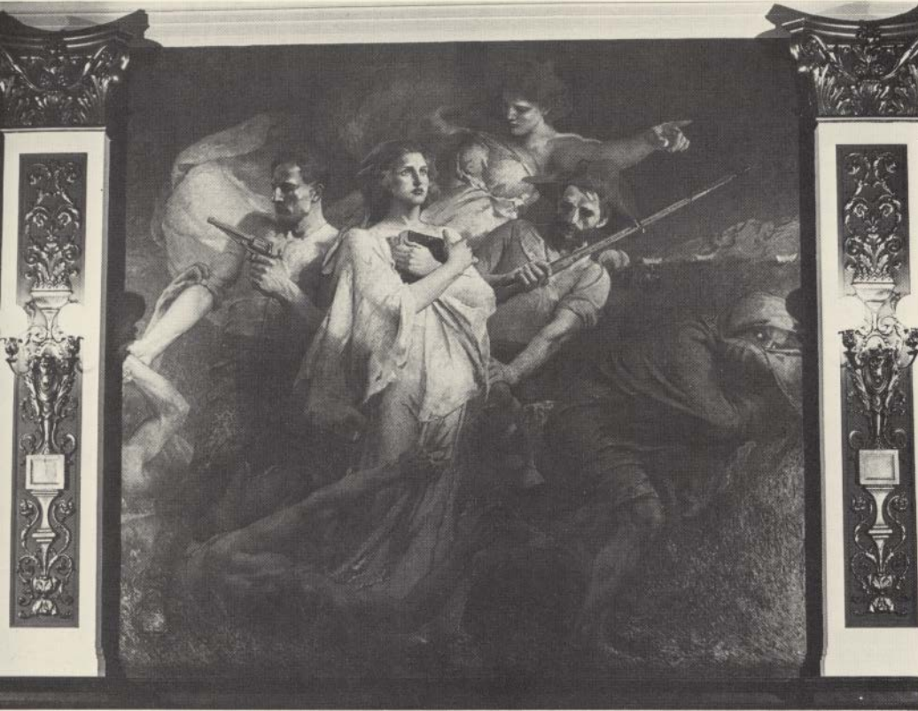
Edwin Howland Blashfield's "Spirit of the People," a 1910 oil on canvas mural in the Governor's Conference Room of the South Dakota Capitol in Pierre, from Renaissance on the Missouri touring exhibition.