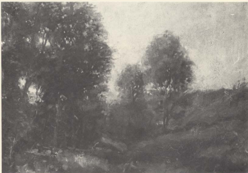
Harvey Dunn's "After the Rain," 1905, oil on canvas, 17 x 24".