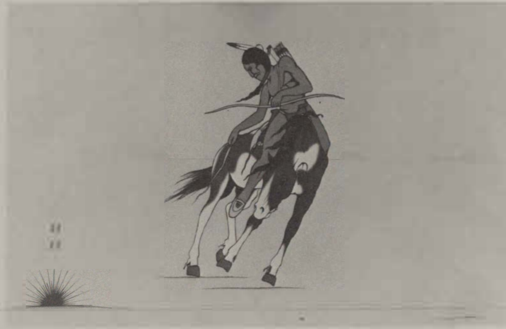
Oscar Howe. Untitled , 1941.