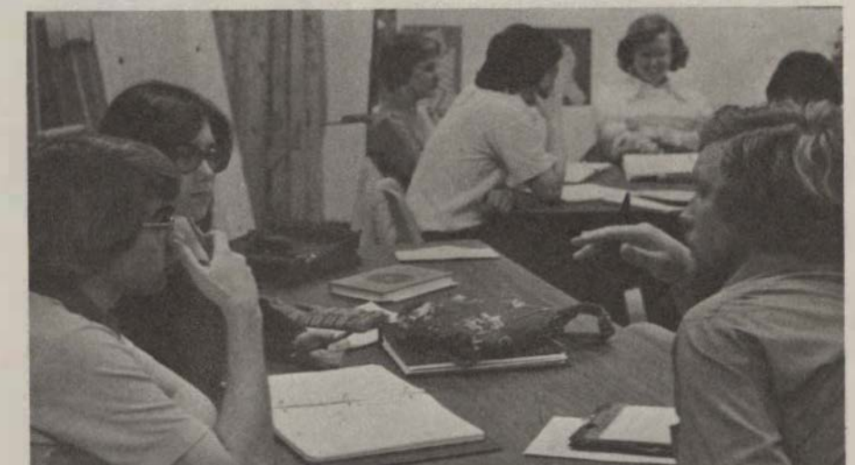
South Dakota State University museology students plan Center display on the life of Harvey Dunn.