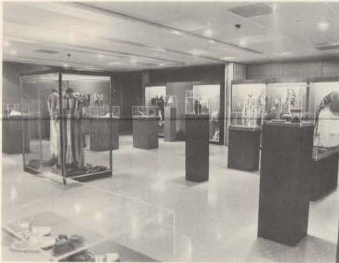
Native American Arts Gallery

On permanent view. Selections from the Center collection of Harvey Dunn Paintings, Marghab Linens, and Native American Arts continue at the Center.