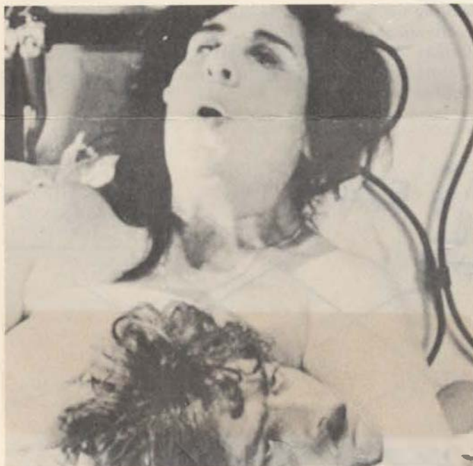
The Seduction of Mimi