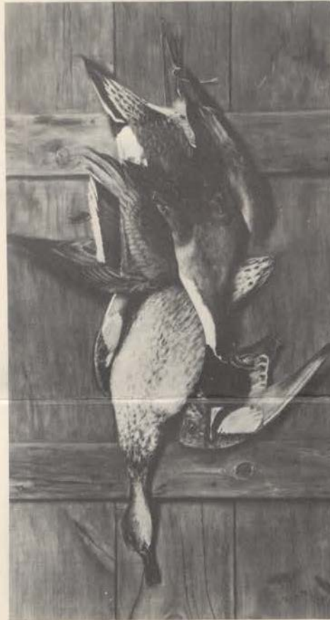
Myra Miller's Pintails , about 1914, from Myra Miller Paintings touring exhibition. Oil on canvas.

September 1. The Center will be open 1:00 - 5:00 p.m. in observance of Labor Day.