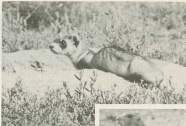
The black-footed ferret and black tailed prairiedog are predator and prey. Widespread poisoning campaigns against the prairie dog brought the ferret to near extinction and greatly reduced its known range. Today the few remaining ferrets are dependent upon our tolerance of prairiedogs, which are still being poisoned

According to South Dakota law, an endangered species is "any species of wildlife or plants which is in danger of extinction throughout all or a significant part of its range other than a species of insects determined by the Game, Fish and Parks Commission or the Secretary of the United States Department of Interior to constitute a pest whose protection under this [law] would present an overwhelming and overriding risk to man." A threatened