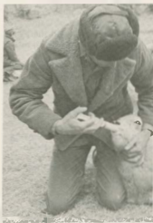
Audubon's bighorn sheep once roamed western South Dakota. But domestic sheep transmitted diseases and competed for forage and winter range. The Audubon's bighorn became extinct in 1918. A partial replacement is the Rocky Mountain bighorn. With careful management, such as treatment for domestic sheep diseases before release, a stable population allows a limited hunting season each year.

Within individual states the state wildlife agency usually has responsibility for managing and protecting endangered species.