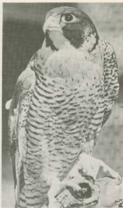
The peregrine falcon was nearly eliminated from the U.S. due to DDT, now banned. The peregrine has been absent from the Black Hills since 1945. In 1979, two young peregrines were successfully reintroduced into the Hills by putting them into the nest of prairie falcons who raised them as their own.

One of the values of endangered species is their use as indicators of quality in our environment. Most endangered species have very narrow habitat requirements, and this makes them susceptible to even minor changes in environmental quality. In other words, they can serve as warning signals for us since any environmental change that affects another animal may eventually affect humans. One good example of this value came when we discovered that the insecticide DDT was slowly