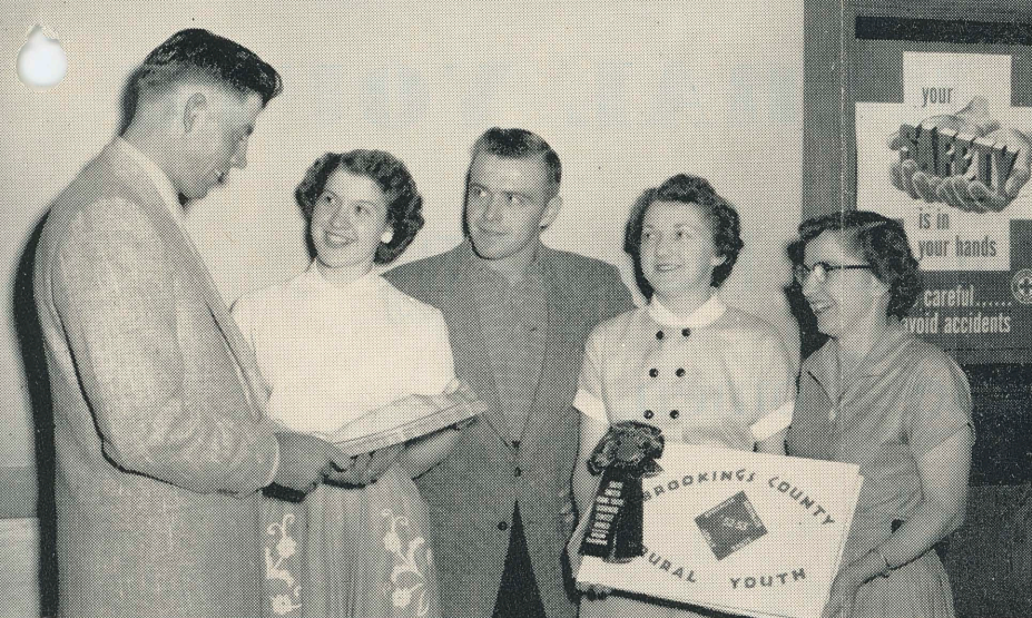
Records of club events are kept by members in attractive scrapbooks.