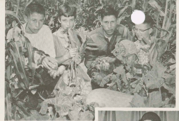
Gardening projects are popular with Indian 4-H boys and girls. Top-quality vegetables are selected for exhibition at the State Fair.

Recreation is an important part of 4-H Club work. Summer camp activities provide club members with opportunities for swimming, volley ball, and a variety of outdoor sports.