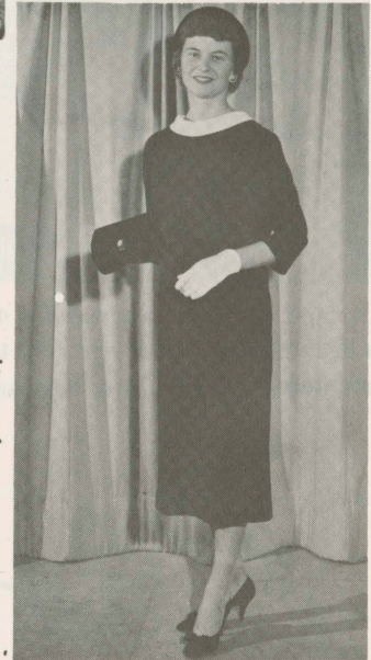
Club members vie for top honors at the State Fair dress review contest.

Home sewing draws the interest of many 4-H girls, who learn how to select patterns and make attractive clothes. Many club members receive state and national awards each year.