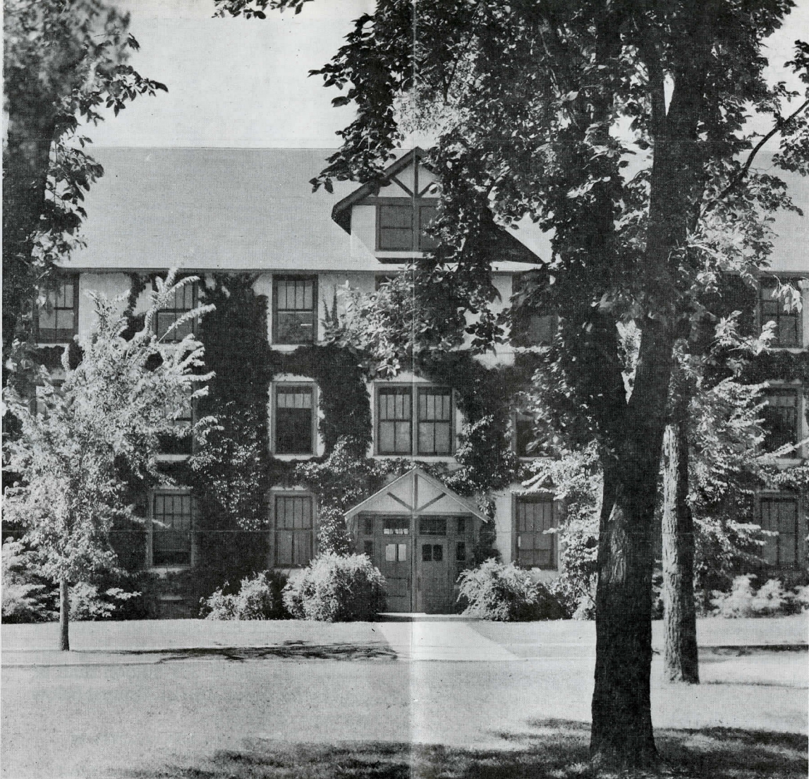
East Men's Hall—The Home of School of Agriculture Students