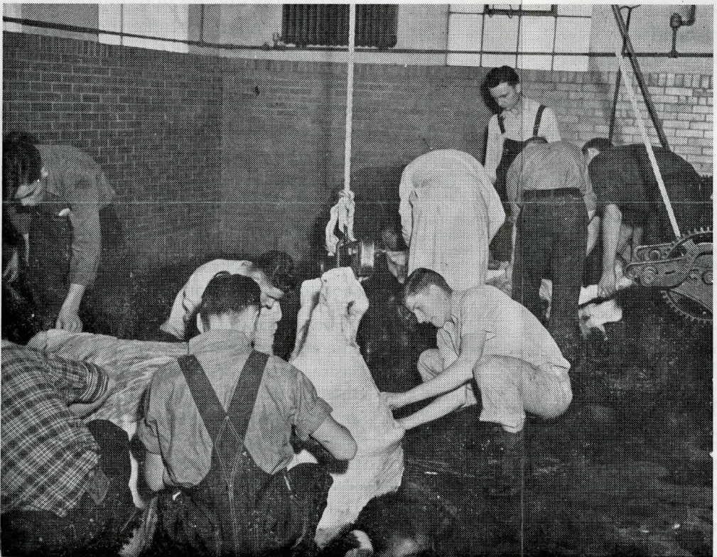
Students Receive Instruction in Farm Butchering