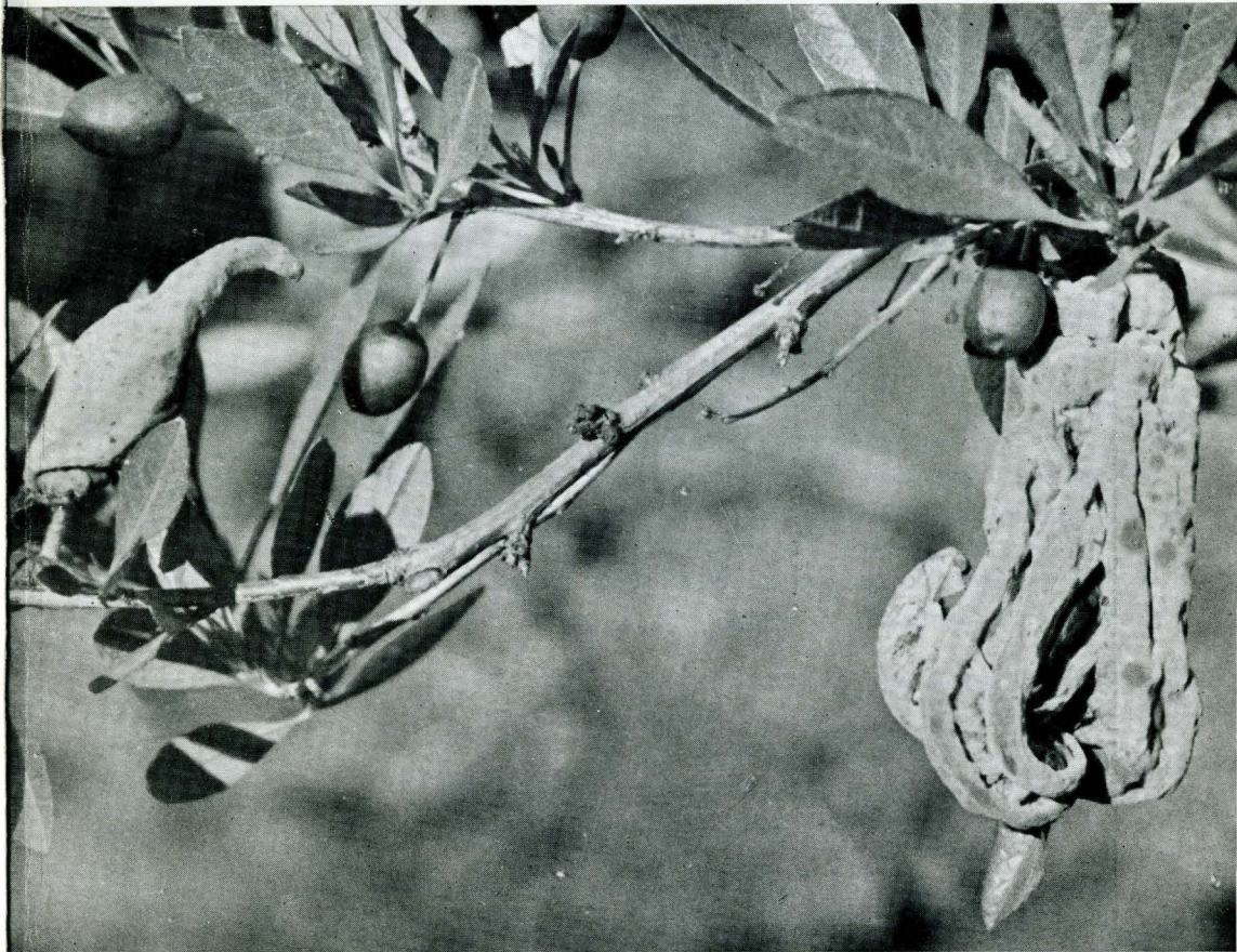
Fig. 1. An enlarged, distorted sand cherry fruit (left) and leaves (right), both as a result of infection by the leaf curl and pockets fungus

PLANT PATHOLOGY DEPARTMENT SOUTH DAKOTA AGRICULTURAL EXPERIMENT STATION SOUTH DAKOTA STATE COLLEGE . . . BROOKINGS