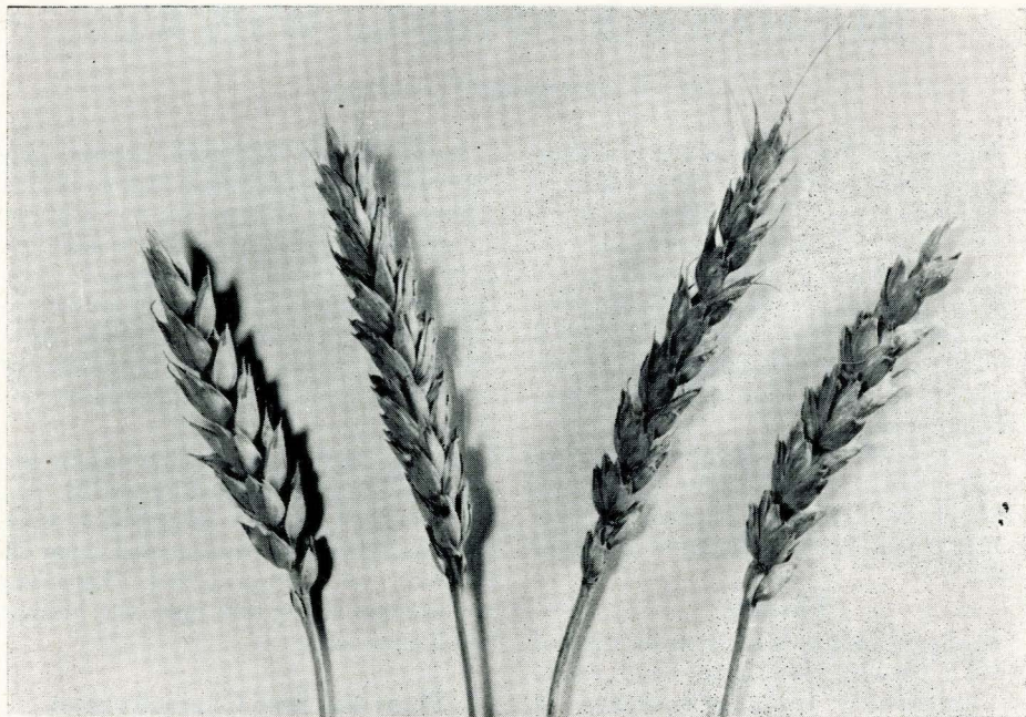
Figure 1. Comparison of heads of Rushmore (left) and heads of Thatcher.

The seeds of Rushmore tend to be short and blocky, as contrasted to the longer, more slender kernels of Pilot (Fig. 2). Seed and plant characteristics of Rushmore may be described best by comparing it with known varieties as shown in Table 1.