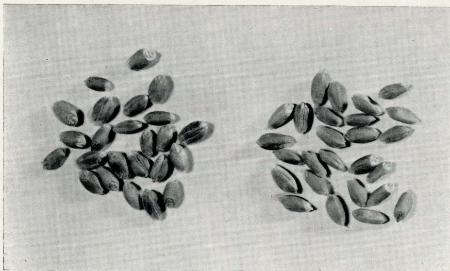
Figure 2. Contrast of seeds of Rushmore (left) and seeds of Pilot.

than the best standard variety at any location, but it ranked first in average yield at three of four locations and second in average yield at Eureka. However, average yields do not tell the complete story. In order to avoid choice of varieties that fluctuate greatly in yield order on a yearly basis, it is necessary to examine the data from which the 5-year averages were calculated (Table 3).