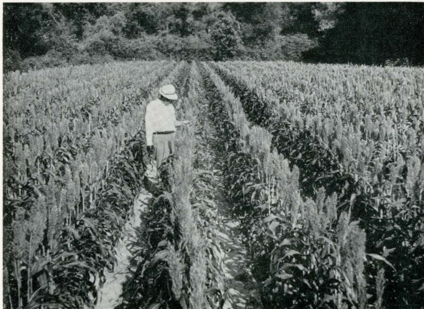
Fig. 2. A foundation field of Norghum.

As indicated in Table 1, Norghum ripens before frost and can be harvested by mid-September. Other grain varieties are later in maturing and often freeze, producing poor quality grain. Norghum is a short stalk sorghum and can be combined readily.