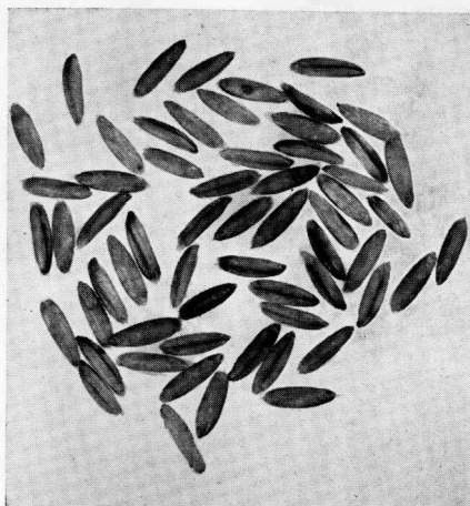
Figure 2. Seed of the new hullless oat. Actual Size

It will be observed that the average yields of James, when adjusted for hulls, compare favorably with the yields of the standard varieties. At Brookings the 4-year average for James exceeds all others by a statistically significant difference. Ecologically, this variety is best suited to