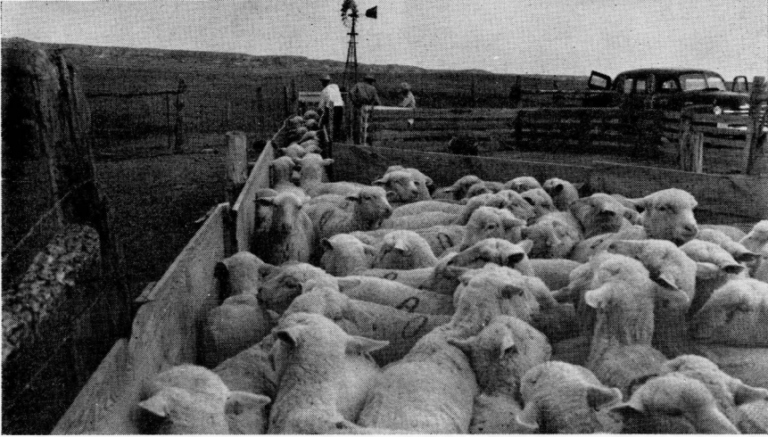
A representative group of the ewes that were used in the grazing level trials at Antelope Range Field Station. These ewes are being weighed and fecal specimens collected.

requirements are not met through the soil or forage.