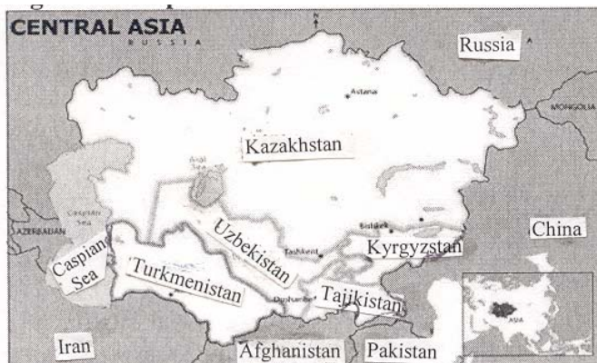
Figure 1. Map of Central Asia

Following the success of the European Union (EU) and other economic blocs, many countries have sought to further their economic growth by integrating their economies with those of other nations. In this Commentator we provide a brief overview of efforts among five nations in the southern part of the Former Soviet Union (FSU) to form an economic bloc. The five nations are referred to here as “Central Asia”, and include Kazakhstan, Kyrgyzstan, Tajikistan, Turkmenistan, and Uzbekistan (Figure 1). After providing background information about the region and describing the transition process following the collapse of the Soviet Union, we explain efforts among the five nations to increase mutual international economic cooperation and assess its economic implications.