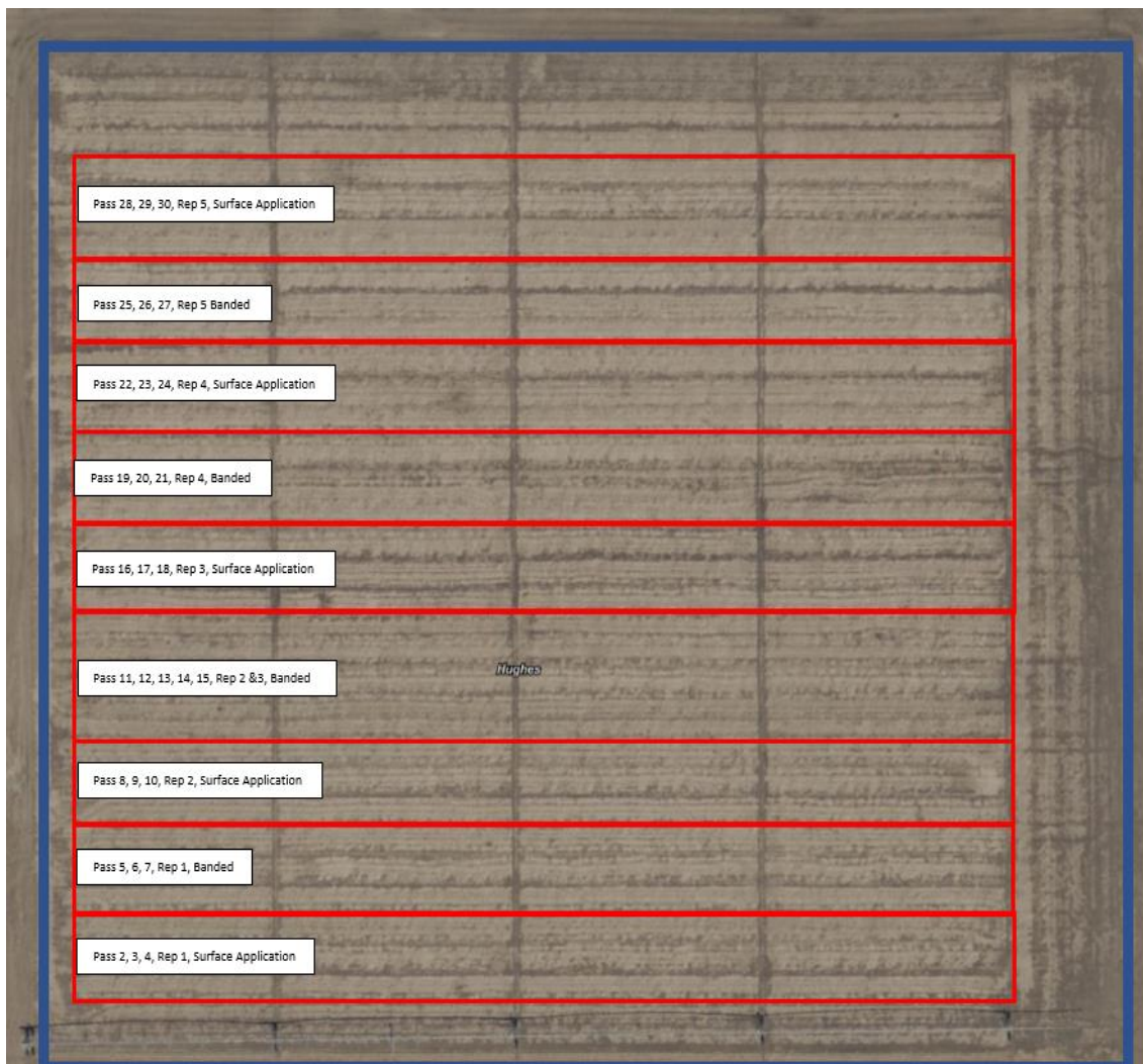
Figure 3.1: Aerial Image of placement study field. The central location of this field is located at 44.290589, -99.998837 Each red box corresponds to a treatment replication with the passes, replication number, and treatment labeled within. The blue box is the border of the entire field where this study takes place. The length of the treatments is approximately 195 meters and treatments are 12.2 meters wide.