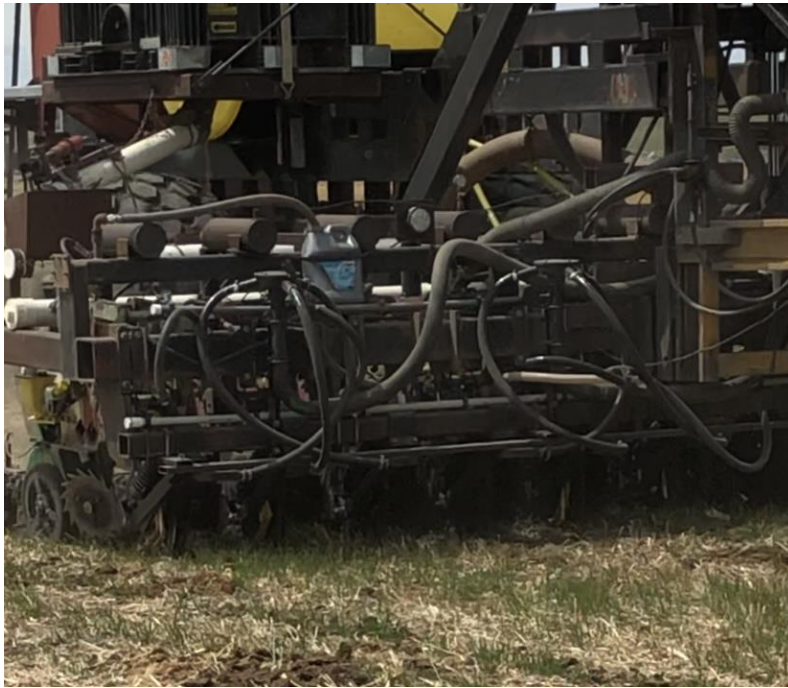
Figure 3.2: Image of Dakota Lakes Resarch Farm concept planter capable of side banding fertilizer as well as broadcasting. This distance image shows the fertilizer carry tubes hooked up to the surface application splash plates. Fertilizer is being applied in front of the planting unit that is planting soybeans in the 2020 growing season.