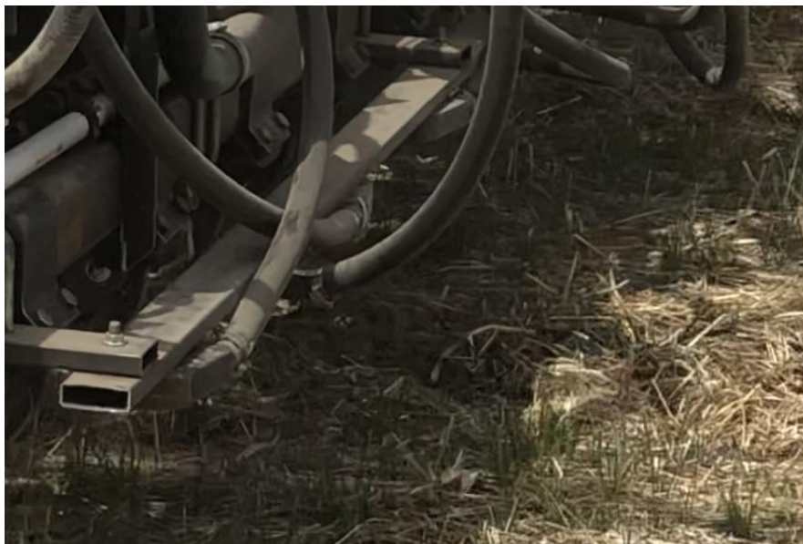
Figure 3.3: Up close image of the surface application portion of the planter. This image was captured mid application and fertilizer can be seen falling from the splash plates onto the soil