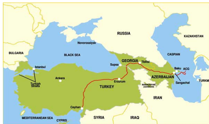
Figure 2. Baku-Tbilisi-Ceyhan main oil export pipeline.

tons of nominal fuel unit. Total investment for the contract is about $ 15 billion. The ACG is one of the largest fields under development in the country.