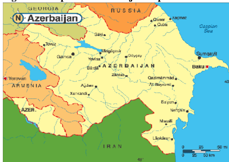
Figure 1. Map of the Azerbaijan Republic

The independence of the Azerbaijan Republic was recognized by the United States on December 25, 1991 and diplomatic relations were established on February 28, 1992. A significant part of economic relations between both countries is concentrated in