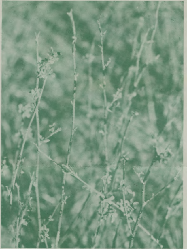
Alfalfa damaged by grasshoppers. Note the small leaves on regrowth.