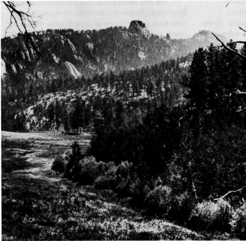
Figure 3. Duplicate photographs of Tenderfoot Creek (1874 and 1974).

The 1874 picture (top) shows a sparse ponderosa pine forest on the hills in the background and a deciduous shrub community along the creek in the foreground. In 1974 the ponderosa pine community is denser and the historic willow community has been replaced by herbaceous plants and coniferous trees indicating drier site conditions.